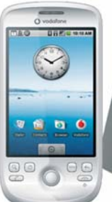
HTC Magic - Exclusive to Vodafone

Expect an update on our SCT Insight e-shot once we've had a chance to put it through its paces